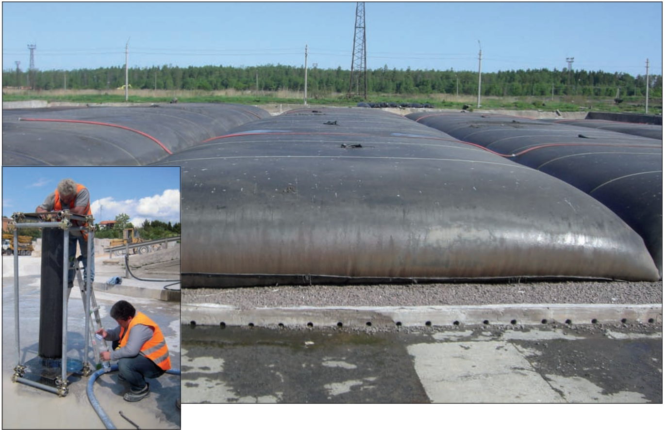
Hanging Bag Filtration Test

The SoilTain® Dewatering Tube is a containment system designed for dewatering a wide variety of sludge types. Gravimetric drainage of the sludge is accompanied by a volume reduction.